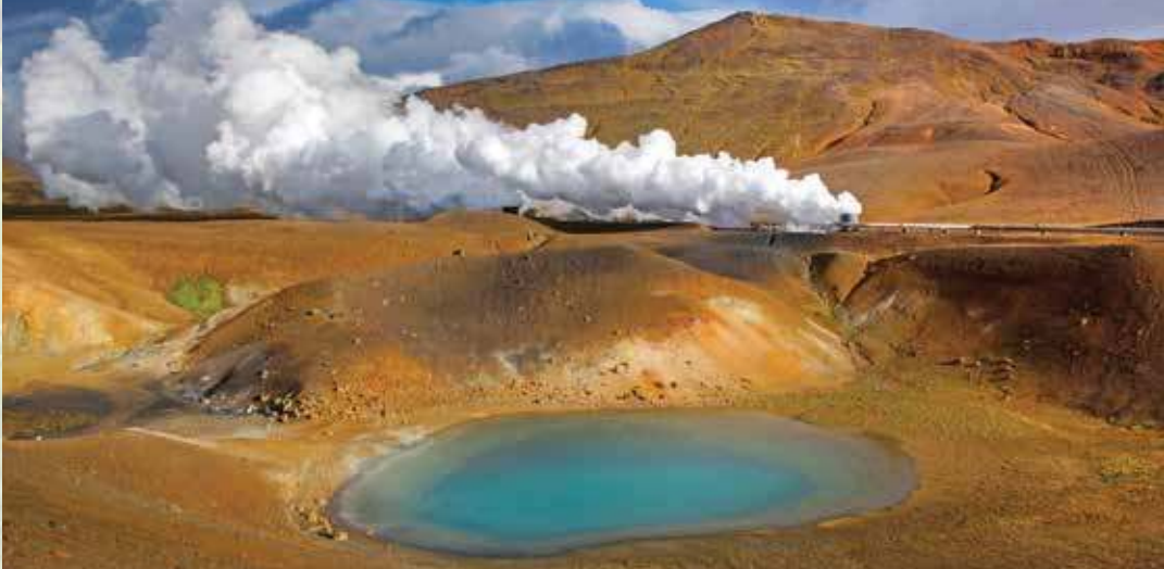
Explore the sulfuric mudpots of Námaskarð, where the mineral-rich, desert-toned terrain appears almost Mars-like.