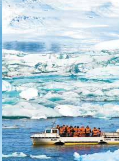
Cruise by small boat through Jökulsárlón glacial lagoon, surrounded by marbled and crystalline icebergs in UNESCO World Heritage Site.

Craggy coastal cliffs and basalt formations host dozens of species of seabirds, including puffins and auks. Walk across the Arctic Circle, where the island is lush with grasses and mosses.