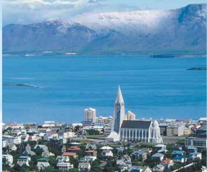
Tour Reykjavik and see the church of Hallgrímskirkja, which mirrors natural basalt formations along Iceland's southern coast.