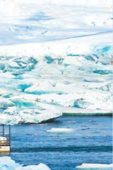
Iceberg lagoon among 1,000-year-old UNESCO-designated Vatnajökull National Park.