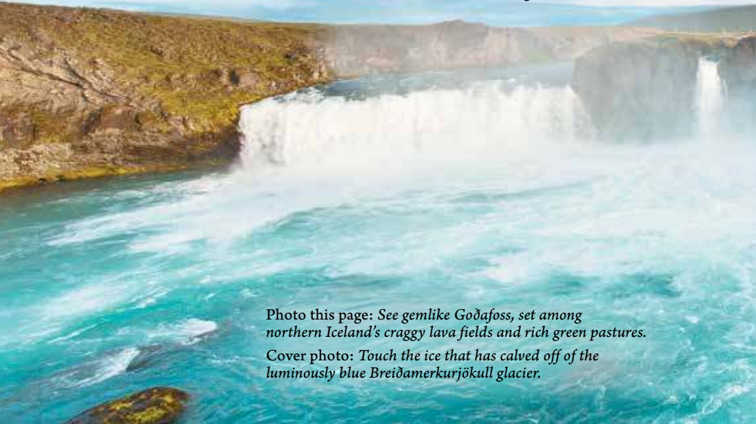
Photo this page: See gemlike Goðafoss, set among northern Iceland's craggy lava fields and rich green pastures.

Spot black guillemots resting on the shore and cliff faces.