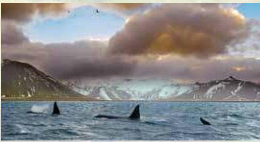
Look for gregarious orcas in Iceland's coastal waters.

Seyðisfjörður is a tranquil, 11-mile-long fjord that winds toward its eponymous town, a thriving artist's community where colorful, chalet-style houses shelter beneath Mount Strandartindur and Mount Bjólfur (Beowulf). Visit the sky-hued Blue Church and observe a specially arranged cultural and musical performance.